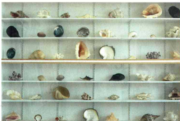
Damien Hirst, Forms Without Life 1991, melamine, wood, steel, glass and assorted sea shells, presented to Tate Gallery, London, 1992