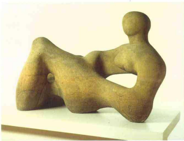
Henry Moore, Recumbent Figure 1938, stone, presented to Tate Gallery, London, 1939

"What is wanted is an intermediary, a suspended state of being or probation, a Purgatory of art before the Paradise of national collections is reached."