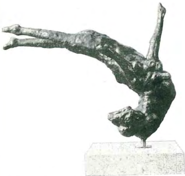
Ralph Brown: Swimming Movement, bronze 1961, presented Swansea