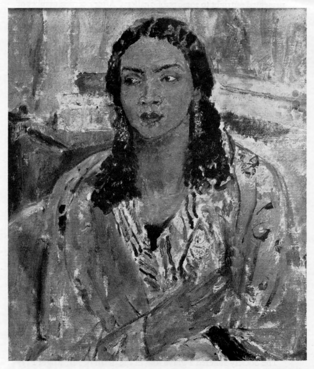
THE BLUE JACKET