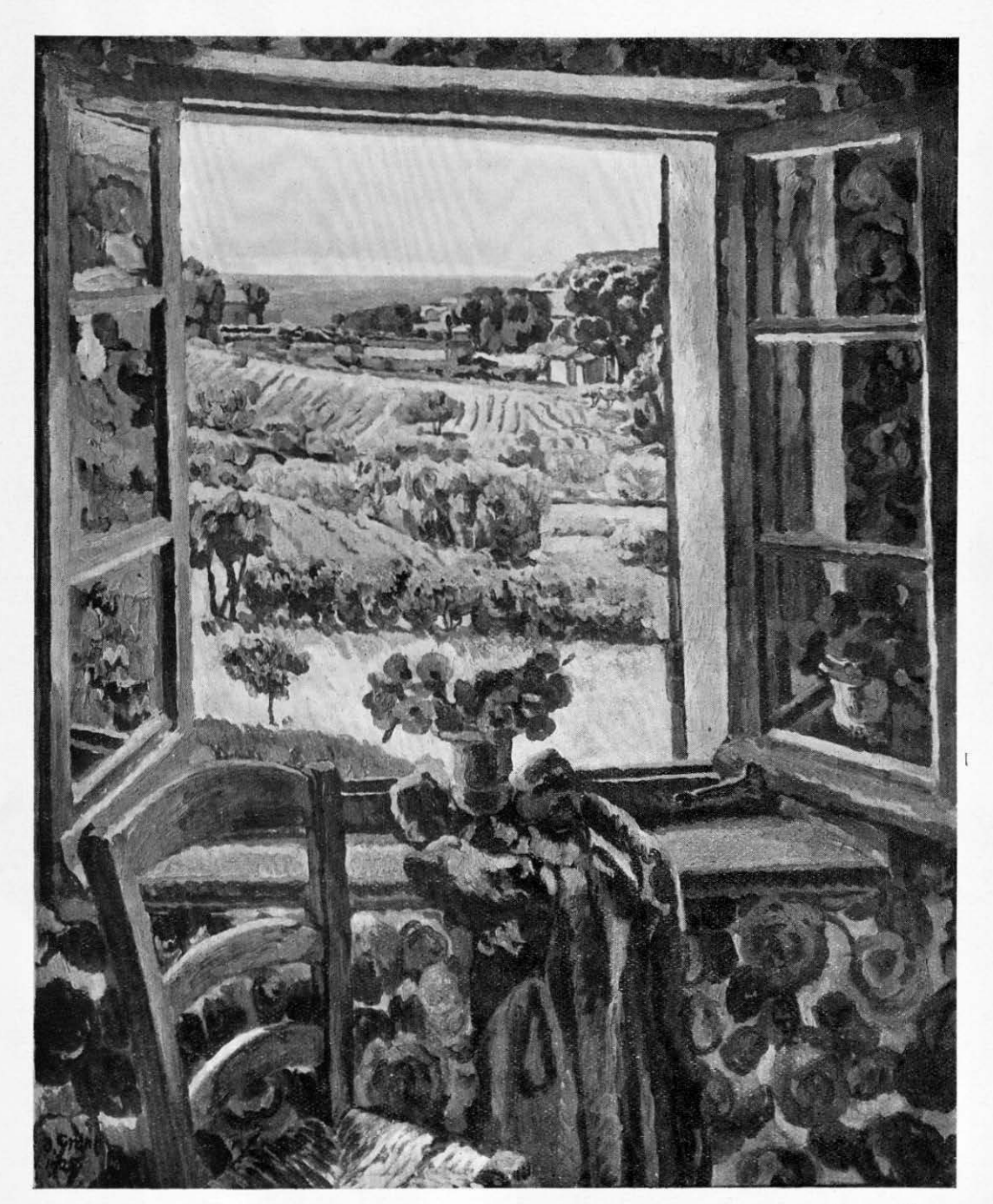
WINDOW SOUTH OF FRANCE