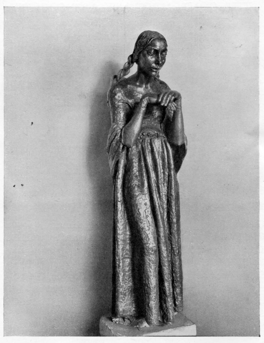
BRONZE Presented to the National Gallery, Millbank, by a body of Subscribers Epstein