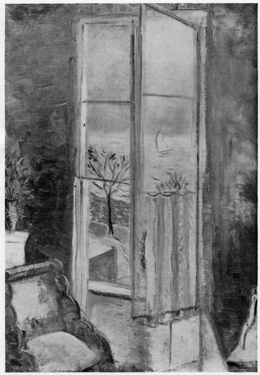
WINDOW AND VIEW